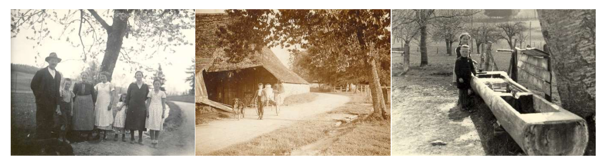
family of the owner around 1920 on the way to the cheese dairy

We extend to you a warm welcome at «Duerrenberg», a house that used to be a farm, settled on the Laengenberg, a small mountain range of the Pre-Alps between Bern and Thun.