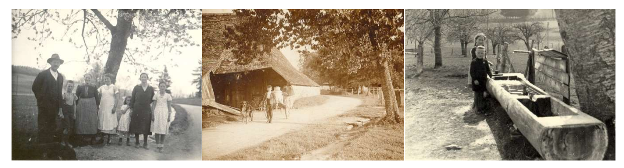
family of the owner around 1920 on the way to the cheese dairy

We extend to you a warm welcome at «Duerrenberg», a house that used to be a farm, settled on the Laengenberg, a small mountain range of the Pre-Alps between Bern and Thun.